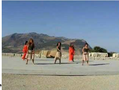
Theater of Segesta “The Bacchae”